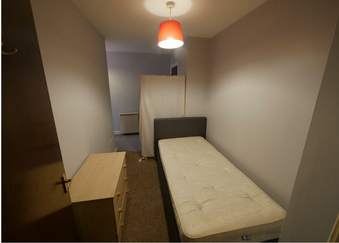
Flat 5 Stirling Court, 28 Manor Bournemouth, BH1 3EZ