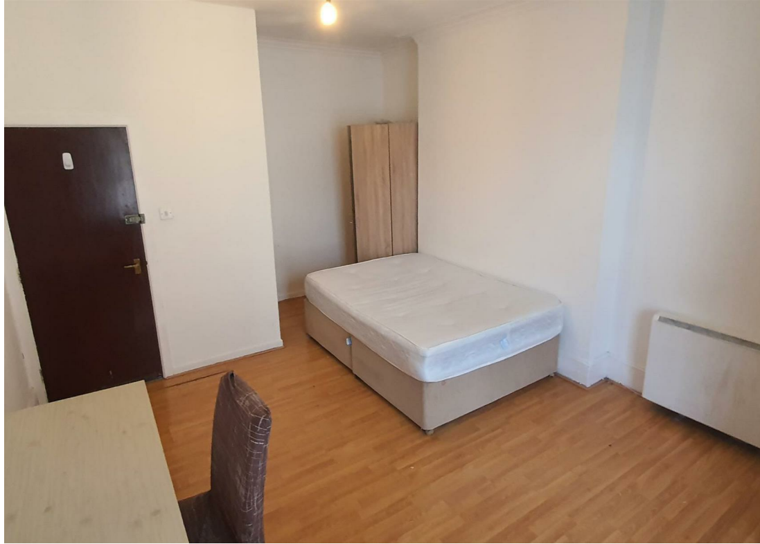
3B Yelverton Road , Bournemouth, BH1 1DA