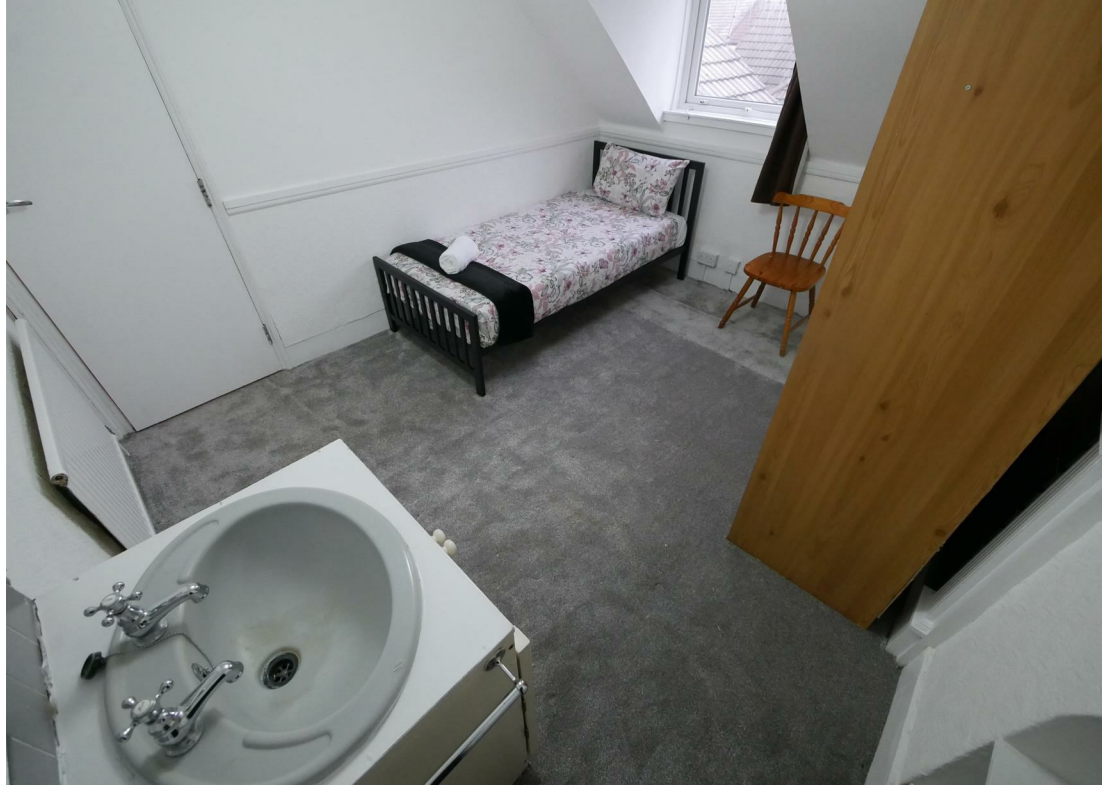
5 Lytton Road , Bournemouth, BH1 4SH